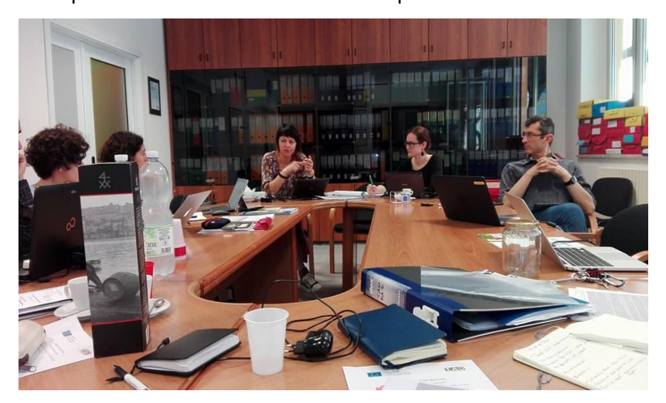
Photo: Some of the TAD Project Team Members at Project Meeting in Torino.

The first project deliverable – the IO1 Report – was presented, in the final stages of completion. ENAT will guide partners on how to present and disseminate the IO1 report.