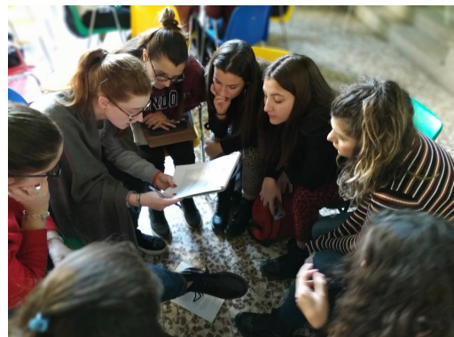
Photos from small events in Turin

The events included the interactive smart phone tool Khaoot, engaging the students in question and answer sessions and through team games, with a final plenary section.