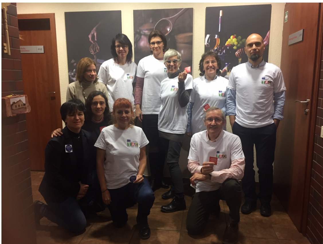
TAD Project Team poses for a final group photo.

The final meeting was hosted by Panevezys LMTC at their premises in Panevezys, Lithuania. The two-day meeting focused on preparing the management procedures and final reports of the project, as well as putting the final touches to the e-Learning Platform and concluding the TAD project evaluation and dissemination activities.