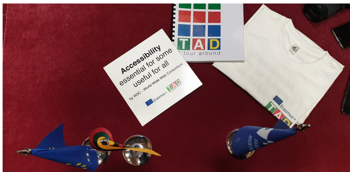
TAD Report and publicity “merchandise”.

Participating in the Erasmus + TAD project allows TecMinho to contribute to the Portuguese Tourism sector, promotion a more inclusive society welcoming everyone, regardless of their impairments, age or gender. The creation of a new professional profile of the Ability Advisor will increase the entrepreneurial spirit and innovation in the sector, and will be a key contribution to making Europe an increasingly accessible tourist destination, as SMEs in the tourism sector will be able to rely on the support of new experts in Accessible Tourism, who will help them significantly to improve the services they provide to the market and, of course, to develop their businesses.