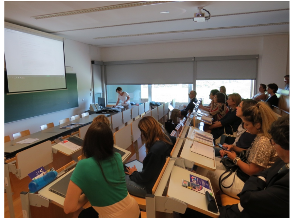
Photos from TAD “Multiplier Event” and “Small Events” in Portugal (TecMinho).